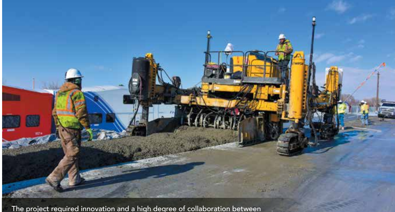
The project required innovation and a high degree of collaboration between Michael Baker and the contractor, Ralph L. Wadsworth Construction Co.

The project was enormously significant — and equally complex. The new lane would stretch for approximately 13 miles, presenting a challenge in itself. Project goals also included improving movements from eastbound and westbound I-215 to southbound I-15 and expanding 7200 South to the west of the freeway to improve traffic flow. In addition, the far-reaching initiative required design and implementation of drainage extensions, detention pond modifications and lighting updates.