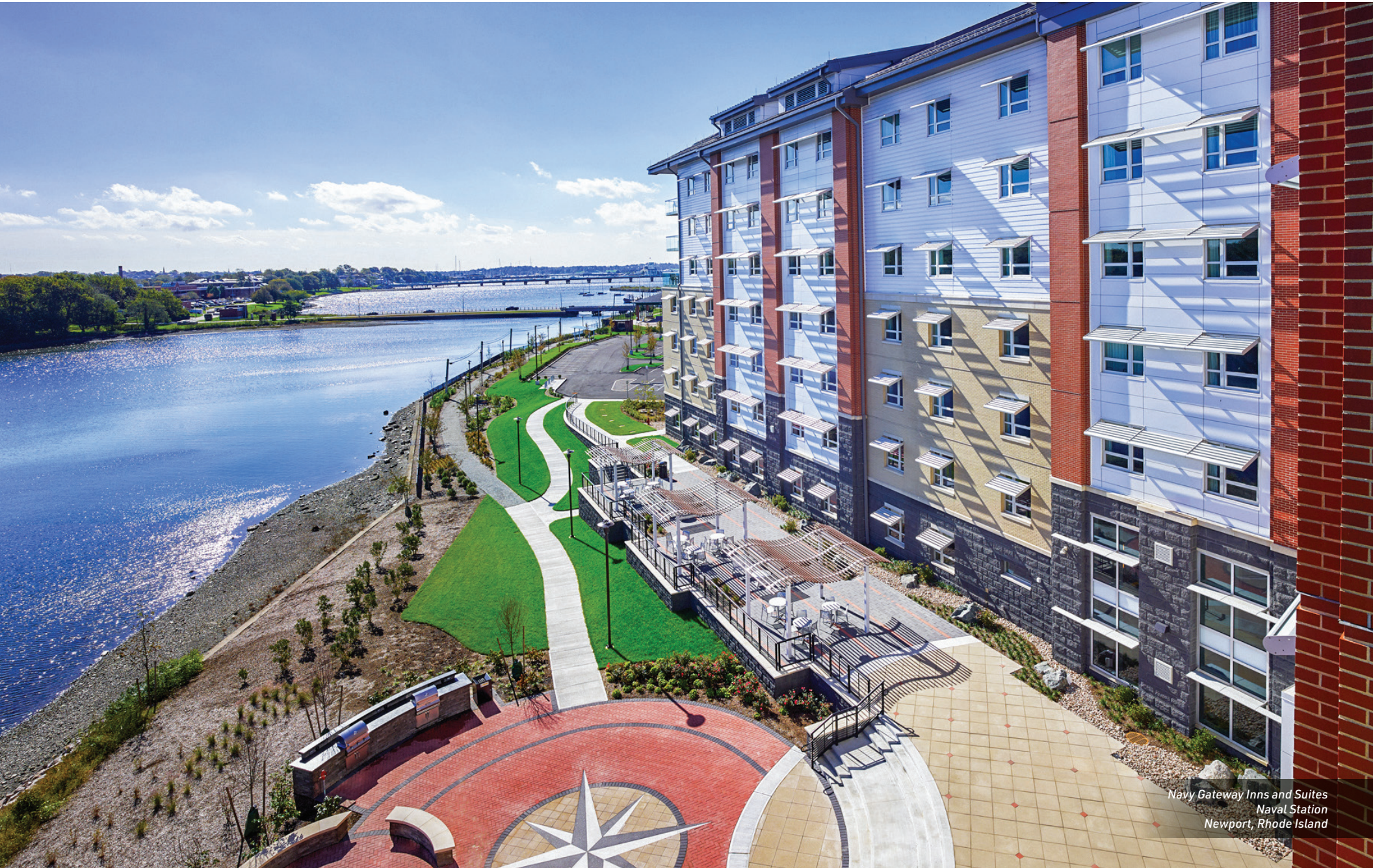
Navy Gateway Inns and Suites Naval Station Newport, Rhode Island