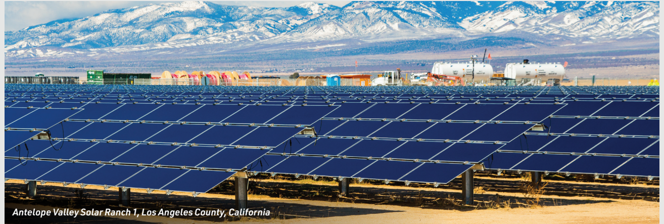
Antelope Valley Solar Ranch 1, Los Angeles County, California