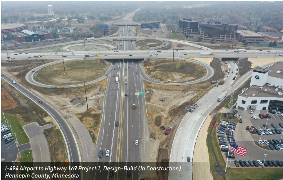
I-494 Airport to Highway 169 Project 1, Design-Build (In Construction) Hennepin County, Minnesota

Our team members have worked with agency staff to refine typical roadway standards, successfully manage right-of-way constraints and balance stakeholder issues, while developing multimodal treatments to improve safety, accessibility and livability. We use the latest visualization and communication technologies to convey information and produce successful projects that have public support.