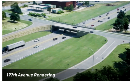
197th Avenue Rendering